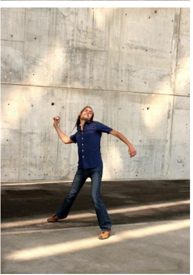
Mabel Palacín, 6 seconds, 2005, artist's book, edition of 500, 21 x 25 cm, éd. Cru 011, Figueras, July 2005. © Adagp, Paris 2014