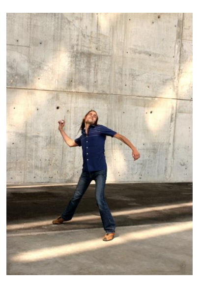
From top to bottom

Hinterland, 2009, video installation. © Adagp, Paris 2014