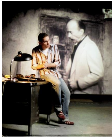
From top to bottom: