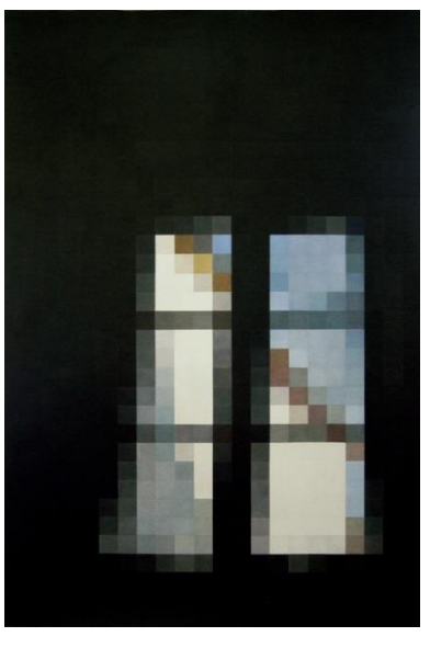
Stéphanie Majoral, Fenêtre #1, 2013, color pencils on paper, 80 x 120 cm

Free visits by appointment, for everyone.