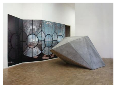
From top to bottom:

Hamid Maghraoui, Raid sat, 2009, video installation